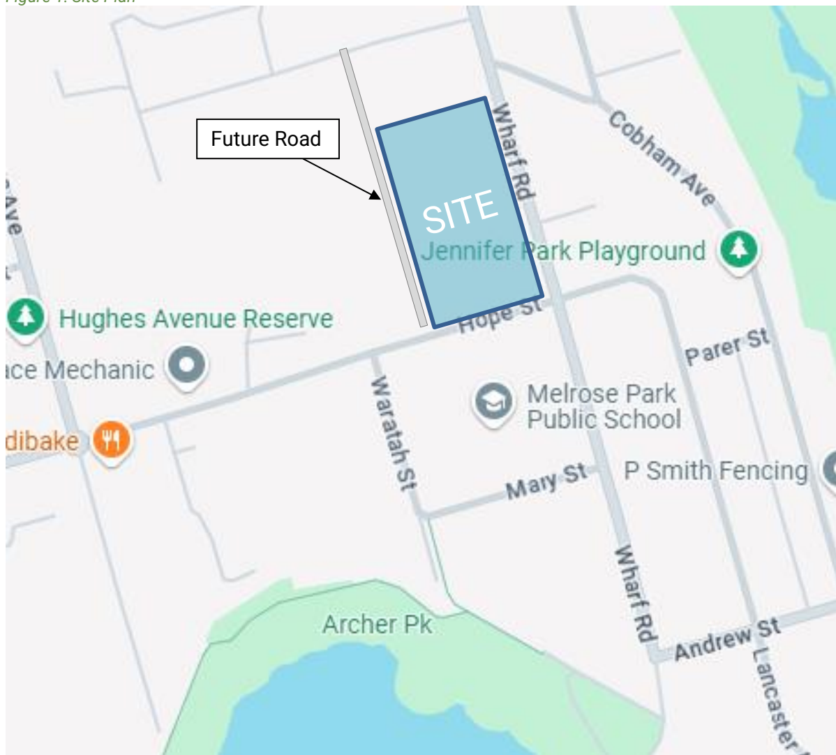
Figure 1: Site Plan

The site is located at 37 Hope Street, Melrose Park within the Parramatta LGA, as shown in Figure.1 (boundaries are indicative only). The school covers an approximate area of 9,500m 2 and is generally rectangular in shape. The site is currently cleared and vacant. The site is located approximately 8km east of the Parramatta CBD. The site has frontages to Hope Street, a future road (as shown in the figure below) and Wharf Road, with vehicular access via the future road.